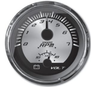
Scale may vary depending on model.

Use stranded, insulated wire not lighter than 18 AWG. Be certain wire insulation is not in danger of melting from engine or exhaust heat or interfering with moving mechanical parts. It is recommended that insulated wire terminals, preferably ring type be used.